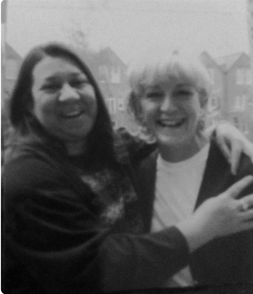
Florence and me in London.